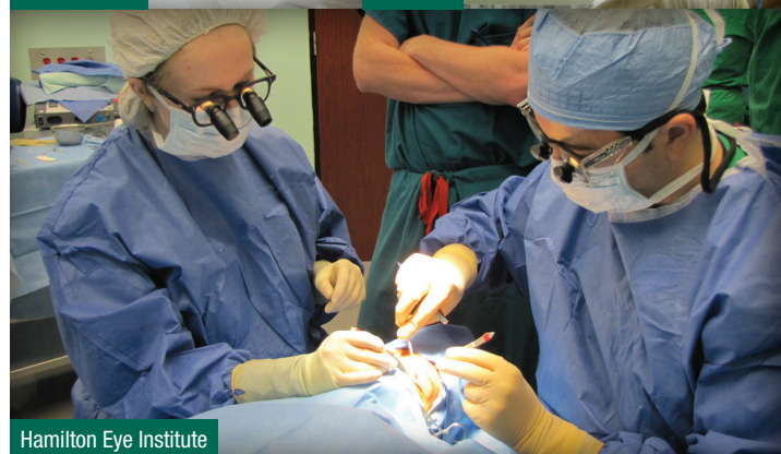
Hamilton Eye Institute