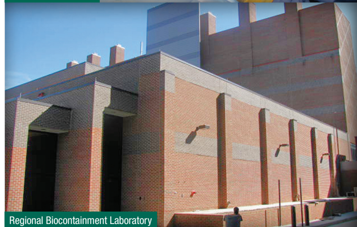
Regional Biocontainment Laboratory