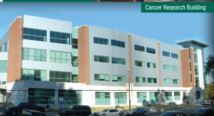
Cancer Research Building