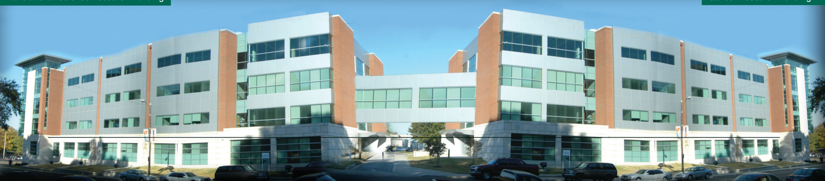
Translational Science Research Building